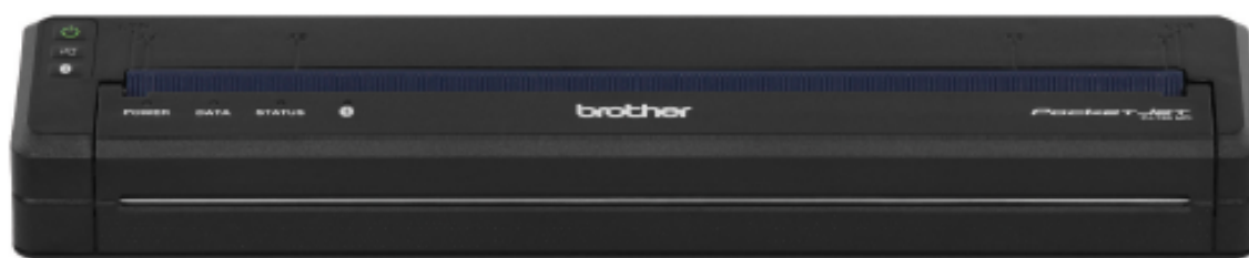
PJ-763 mobile printer