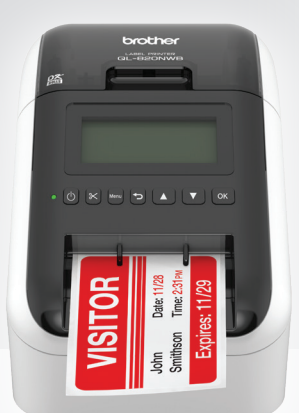
QL-820NWB Wired LAN, Wireless, Bluetooth and USB connectivity