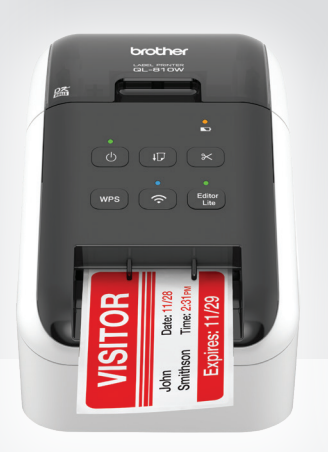
QL-810W Wireless and USB connectivity

With Brother, Greetly could offer an amazing two-colour (red and black) labels printing for their customers.