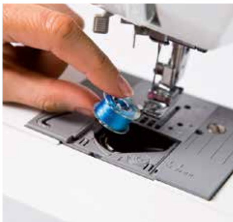
Quick-set bobbin – just drop in a full bobbin and you are ready to sew