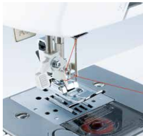
Easy automatic needle threading

Wide range of optional accessories available including quilting feet, etc.